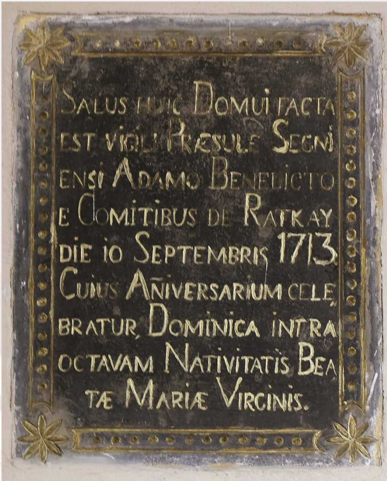
Vinagora, župna crkva Pohođenja Bl. Dj. Marije, natpis u crkvi o posvećenju crkve 1713.

Vinagora, parish church of the Visitation of the Blessed Virgin Mary, inscription in the church about its consecration in 1713