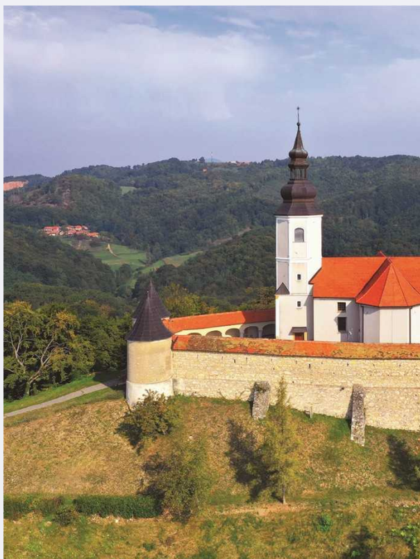
Vinagora, župna crkva Pohodaenja Bl. Dj. Marije