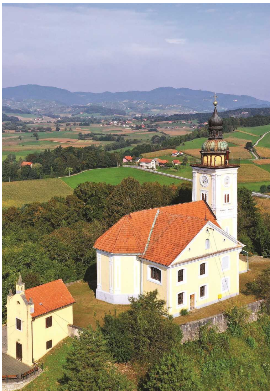
Zagorska Sela, župna crkva sv. Katarine Zagorska Sela, St Catherine's parish church

Na naslovnoj strani: Taborsko, župna crkva Uznesenja Bl. Dj. Marije, glavni oltar s grbom obitelji Rattkay