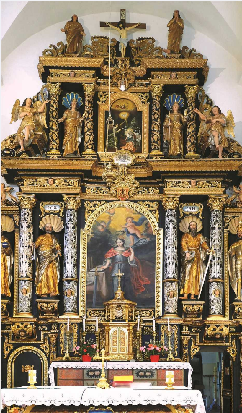
Krapina, crkva sv. Katarine, glavni oltar