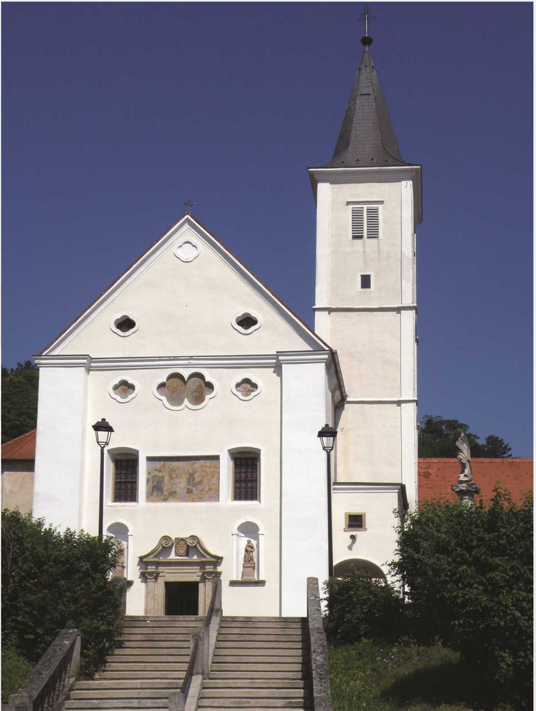
Krapina, crkva sv. Katarine uz franjevački samostan

Krapina, St Catherine's church alongside the Franciscan Monastery