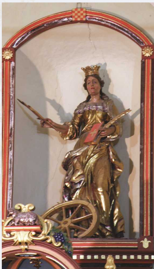
Zagorska Sela, župna crkva sv. Katarine, kip sv. Katarine na glavnom oltaru

Zagorska Sela, St Catherine's parish church, statue of St Catherine on the high altar