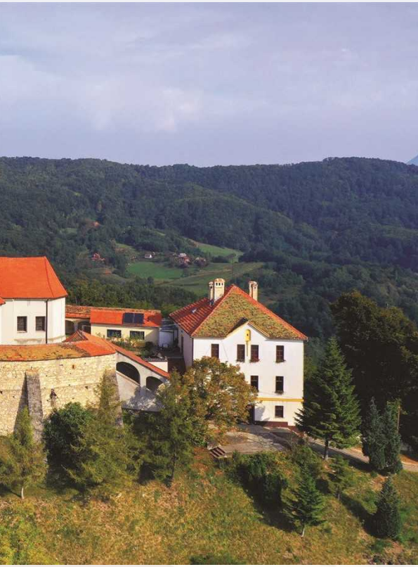
Vinagora, parish church of the Visitation of the Blessed Virgin Mary